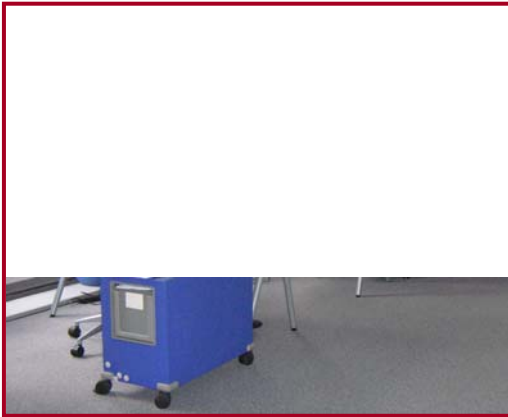
Office: our home in Manchester

Our UK office is based in Manchester, supported by our headquarters in Norway. Other subsidiary locations include Sweden, Denmark, Finland, Poland and Russia.