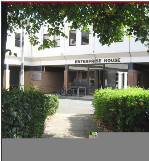
Location: Manchester Science Park

Dedication to projects and a clear vision of professional pride make us important providers of clinical development in Europe.