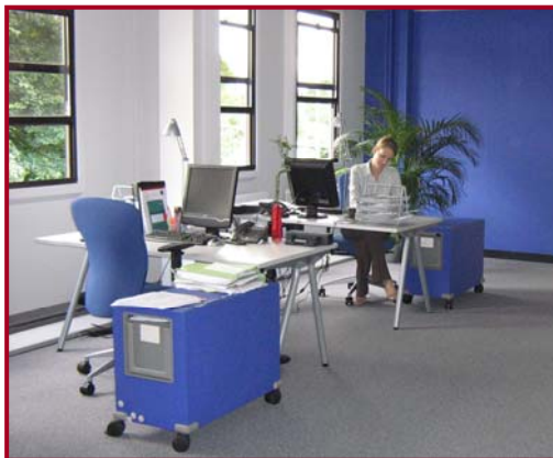
Office: our home in Manchester

Our UK office is based in Manchester, supported by our headquarters in Norway. Other subsidiary locations include Sweden, Denmark, Finland, Poland and Russia.